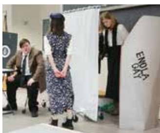
National History Day

The High School Forensics Team not only met their school record for medals earned at State (see article on page 5), they also received an Excellence in Speech Award. The top five percent of schools are recognized with this award and only 19 of the 340 high schools from across the state took home the plaque this year.